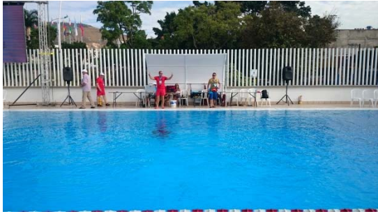
The deck referee indicates 1 minute before the game/half's start