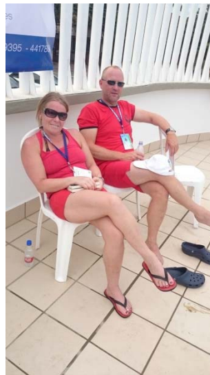
Being ready to support is a relaxing and educational task