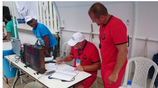
The deck referee is responsible to make sure the match protocol is accurate before the teams sign it