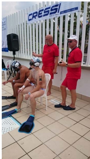
Supporting the deck referee, with for example time penalties, is essential in order to have a smooth game