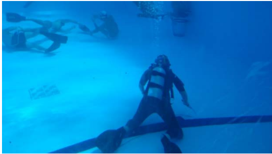
Two water referees observe the game from the bottom of the pool