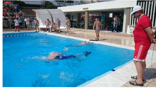
A deck/land referee observes the game and make sure the protocol is accurate and protocol table is informed of the events