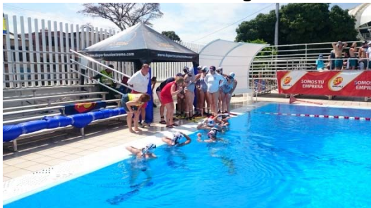
The deck referee should if needed pass on observation from the referees to the teams which can be done during the breaks if not urgent